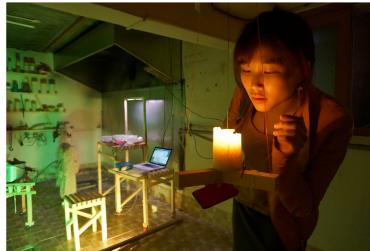
Installation view for residency program opendays <Remember me my 30days> 5.5. - 5.6, 2013 in Seoul